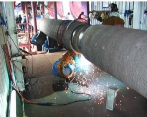
From top: Yarra Bridge Melbourne, Dam Strengthening Sydney, Gas Pipeline Malaysia.