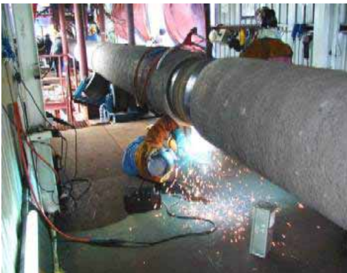
From top: Yarra Bridge Melbourne, Dam Strengthening Sydney, Gas Pipeline Malaysia.